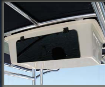
T-TOP ELECTRONICS BOX