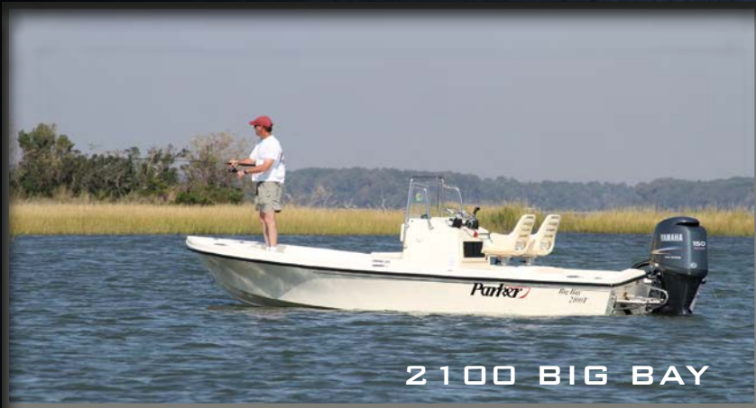
2100 BIG BAY