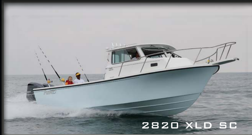
2820 XLD SC