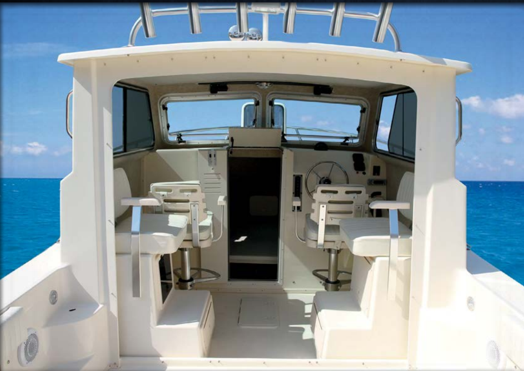
OPEN BACK PILOT HOUSE