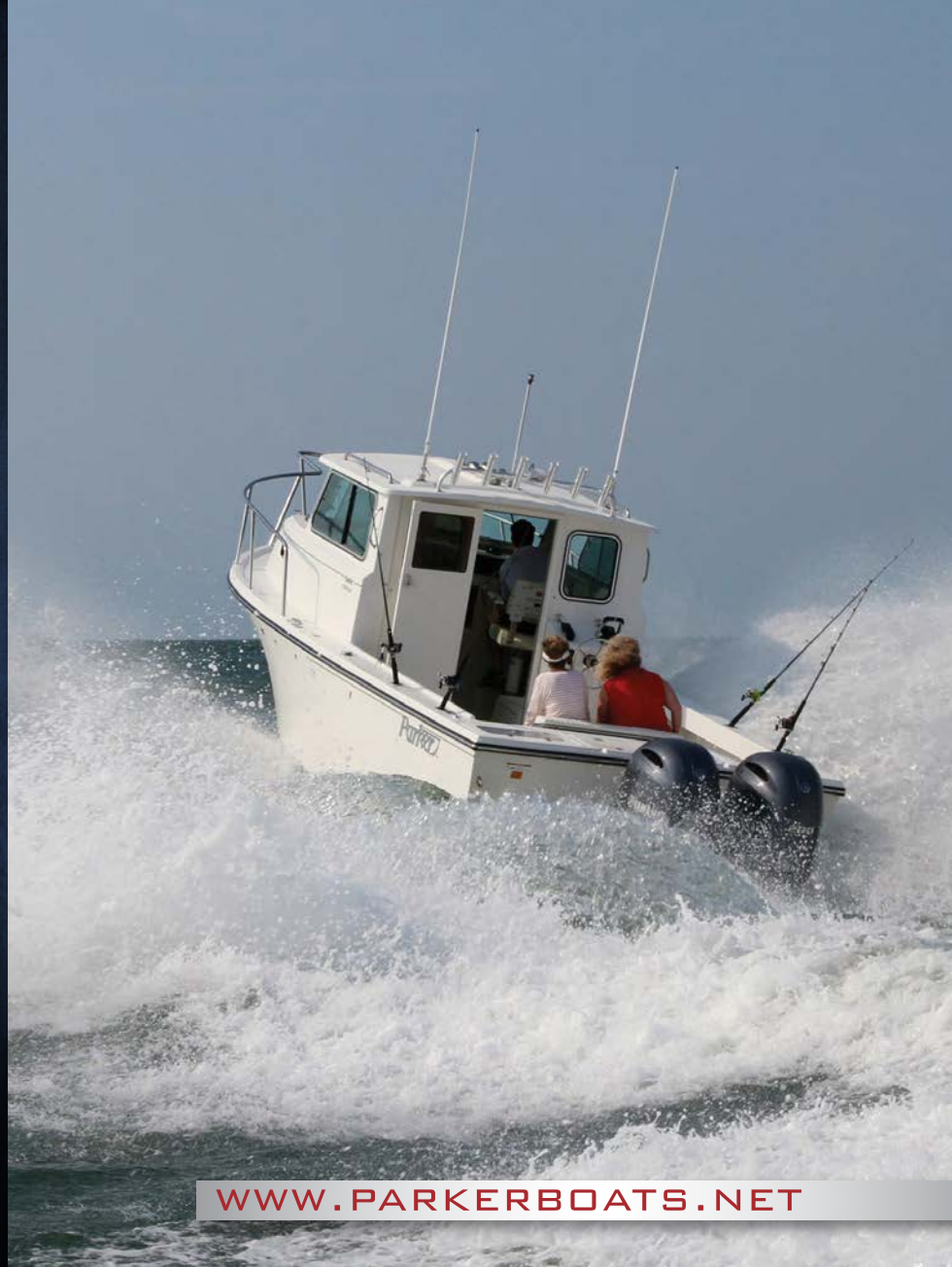
NEW WALK-THROUGH TRANSOM W/ FISHBOX & LIVEWELL