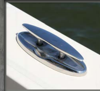
PULL UP CLEAT

So, you've got your sights set, now it's time to customize. Parker offers many options standard, but we understand you may want more.