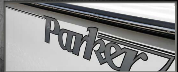
STAINLESS STEEL RUB RAIL