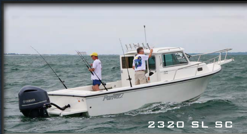
2320 SL SC