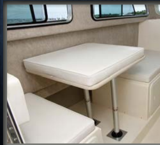
CONVERTIBLE DINETTE [2530]

Each model differs, for a full list of standard and optional equipment or accessories, we invite you to stop by a dealer near you or visit us online at