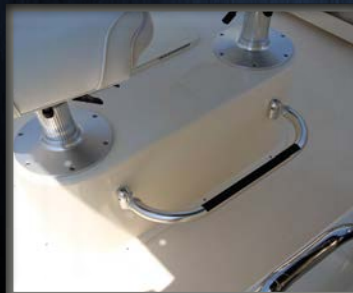
FOLDING FOOT REST