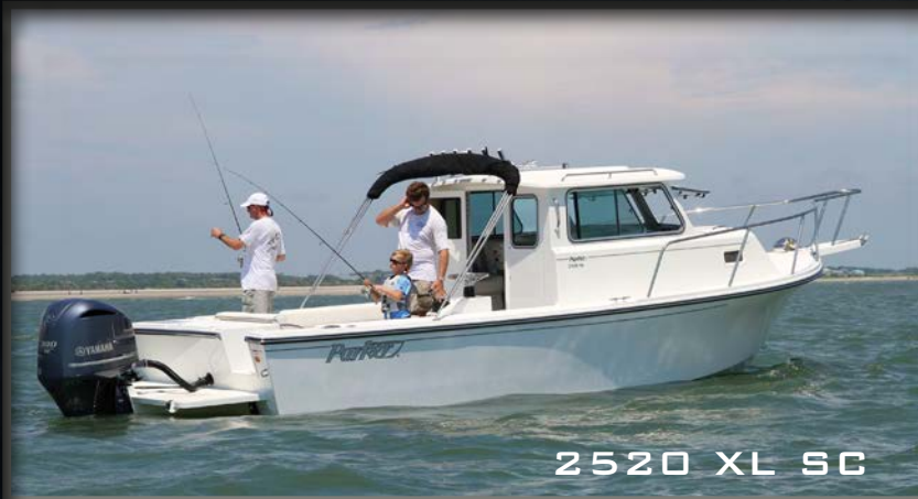
2520 XL SC