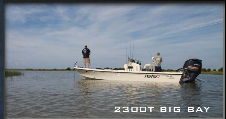
2300T BIG BAY