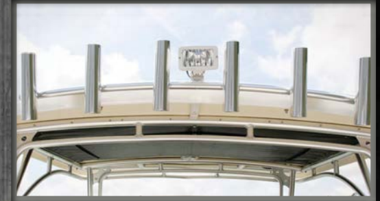
HARDTOP W/ OVERHEAD STORAGE