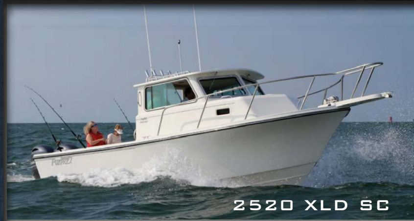
2520 XLD SC