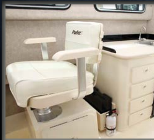
GALLEY PACKAGE [2530]