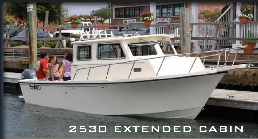
2530 EXTENDED CABIN