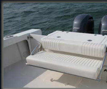
FOLDING LOUNGE SEAT